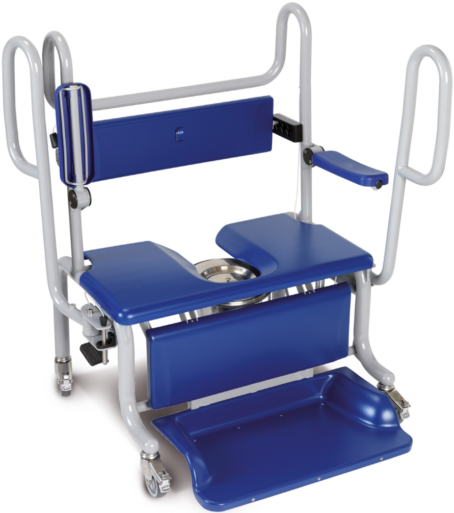
Carmina BARIATRIC SHOWER COMMODE CHAIR

Addressing the hygiene needs of larger patients can be a key challenge in bariatric care. If appropriate solutions are unavailable, caregivers may be subjected to increased physical overload during patient handling and hygiene activities.