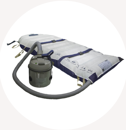
AirPal® AIR-ASSISTED PATIENT TRANSFER SYSTEM