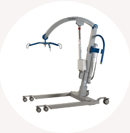
Tenor FLOOR LIFT SYSTEM