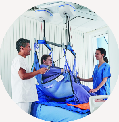
Maxi Sky 2 Plus CEILING LIFT SYSTEM

All solutions, including ceiling lifts, floor lifts and lateral transfer devices are specifically designed to enable caregivers to help improve dignity and comfort of larger patients.